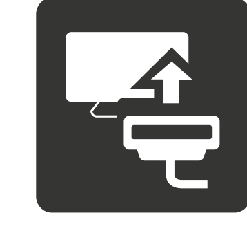
Bluetooth Headset HDMI Output